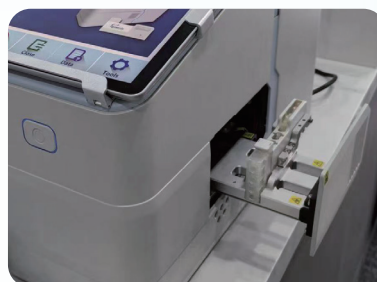
Load iCassette to the instrument