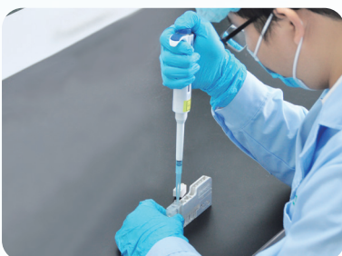
Add sample to the iCassette