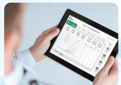
Results report automatically